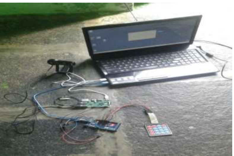
Figure 3. working model of proposed system

In arduino pins 2, 3,4,5,6,7,8,9 are connected to keypad and pin11 is connected to voltage converter and the voltage converter is connected to GPIO7 in raspberry pi. The usb camera is connected to raspberry pi through usb port. The Fig shows the email output which send through the python code