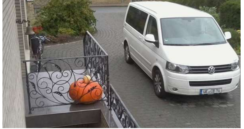
Figure 4. Image send to email