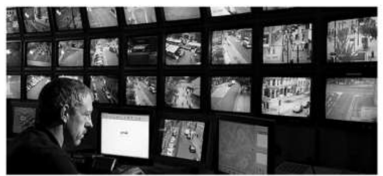
Figure 1: Control room.

make a significant amount of mistakes when they are watching to surveillance monitors. The main reason is the nature of the task: passively watching multiple monitor screens where nothing special happens for a long period of time. Research has been done to help the operators with the task to keep an overview. However, if we could ease the task of the human operator by watching the monitor screens for him, the chance of preventing incidents is expected to increase significantly. Another problem is that hiring people is expensive, so the monitors are watched only when necessary. In contrast, computers can work for 24 hours a day and 7 days a week without large expenses.